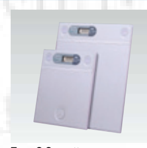
Type C Cassette:

35.4 x 43.0cm/25.2 x 30.3cm are shown, other sizes also available.