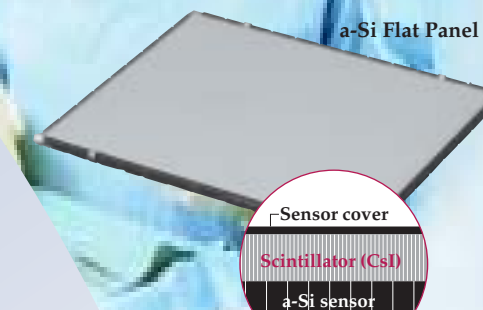
Cutaway diagram of a-Si Flat Panel Detector layers