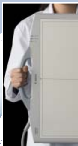
Easy-carry ergonomic design, weighs just 10.6 lb. (4.8 kg).

Less than an inch thick (23 mm) and weighing only 10.6 lb. (4.8 kg), the compact CXDI-50C can be flexibly used in diverse applications, including trauma, ICU, and bedside exams. It's portable, lightweight, and easy to position—even the patient can comfortably hold the unit in place during image capture, if necessary.